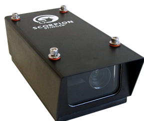
Scorpion2D Stinger Camera